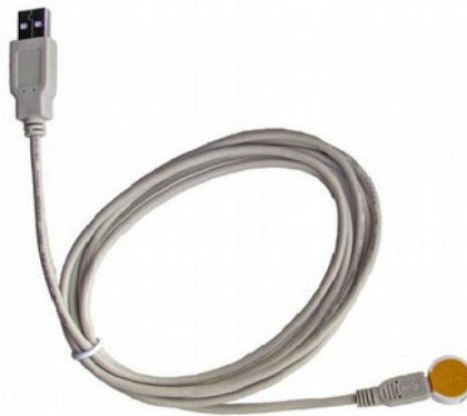
Fig.3. Water Electrode with External Inductor